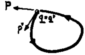
Figure 34.1: A returning trajectory in the configuration space. The orbit is periodic in the full phase space only if the initial and the final momenta of a returning trajectory coincide as well.